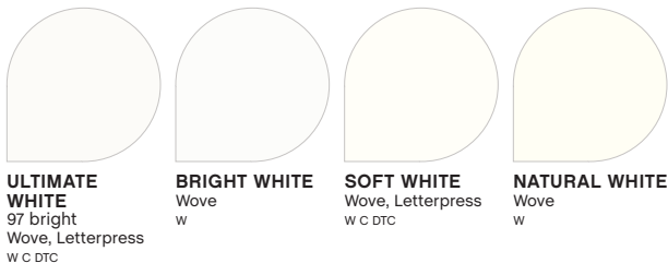
ULTIMATE WHITE 97 bright Wove, Letterpress W C DTC