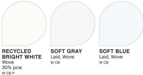
RECYCLED BRIGHT WHITE Wove 30% pcw W CB P