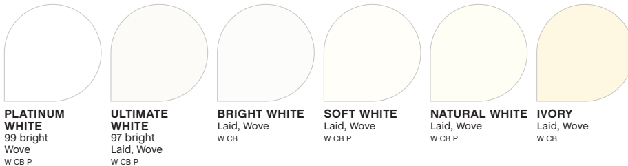
PLATINUM WHITE 99 bright Wove W CB P

W = Writing, CB = Cover Bristol, P = Pressure-sensitive label